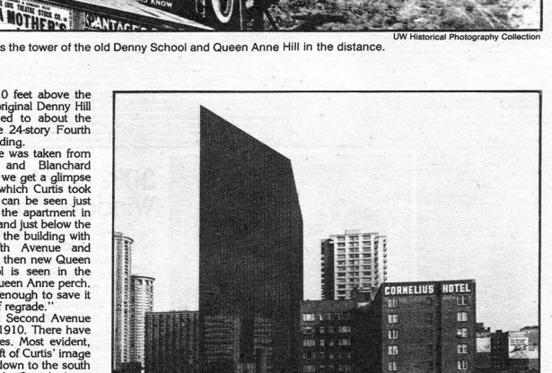
The original Denny Hill would have reached to the eighth story of this contemporary spike, the Fourth and Blanchard Building.

The billboard along Second Ave-nue reads "Diamond Tires, Users Know." Already in 1910 these "users" also knew that the automobile was turning the primary rationalization for leveling the hill, that it was too steep for horses to climb, into an example of antiquated horse sense